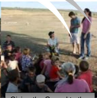
Giving the Gospel to the Little People.