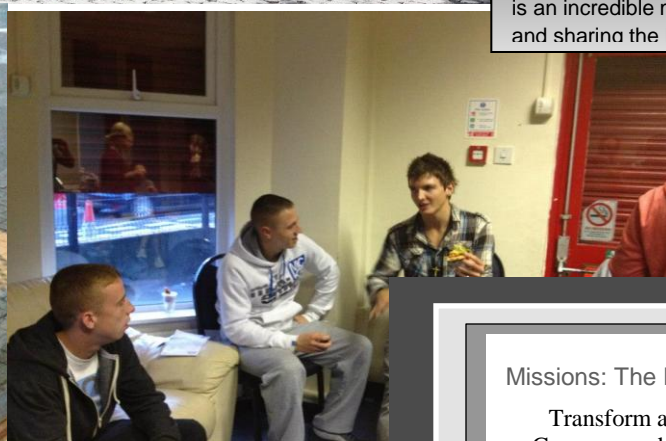
For hours we contemplated the questions of life with a group of atheists our age. The man I got to spend most of the night with was so close to accepting Jesus as his savior. Please pray for him