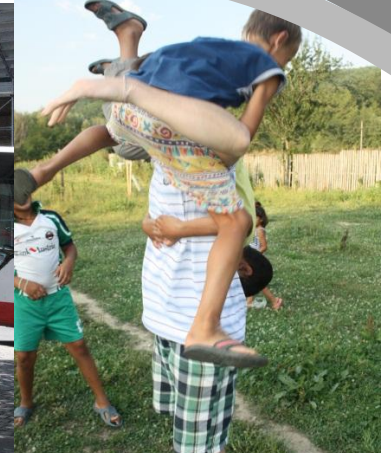
Connecting with the gypsy kids. They're often neglected so attention is an incredible means of showing and sharing the love of Christ.