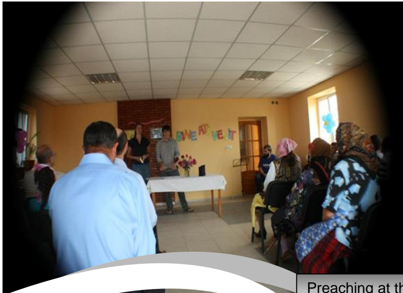
Preaching at the Church