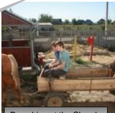
Preaching at the Church