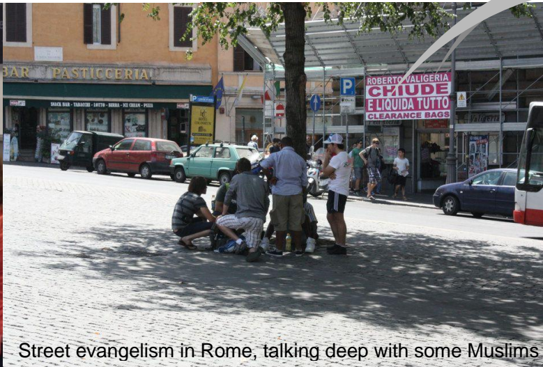
Street evangelism in Rome, talking deep with some Muslims