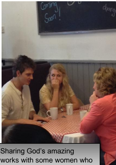
Sharing God's amazing works with some women who were unsure about their faith.

To hear all the stories visit www.mikeheil.com