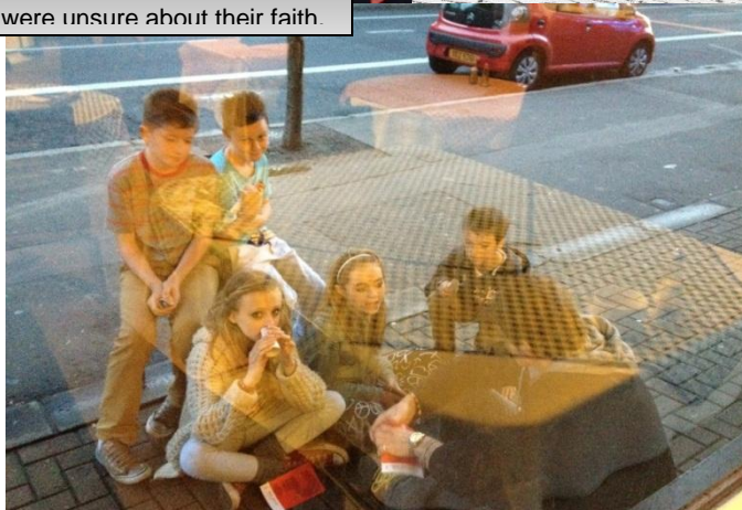
Several kid's came to Christ during our time in Northern Ireland. . These little street rebels saw our church service and wanted to ruin it by playing pranks. Little did they know that their rebellious acts would deliver them the truth of life.